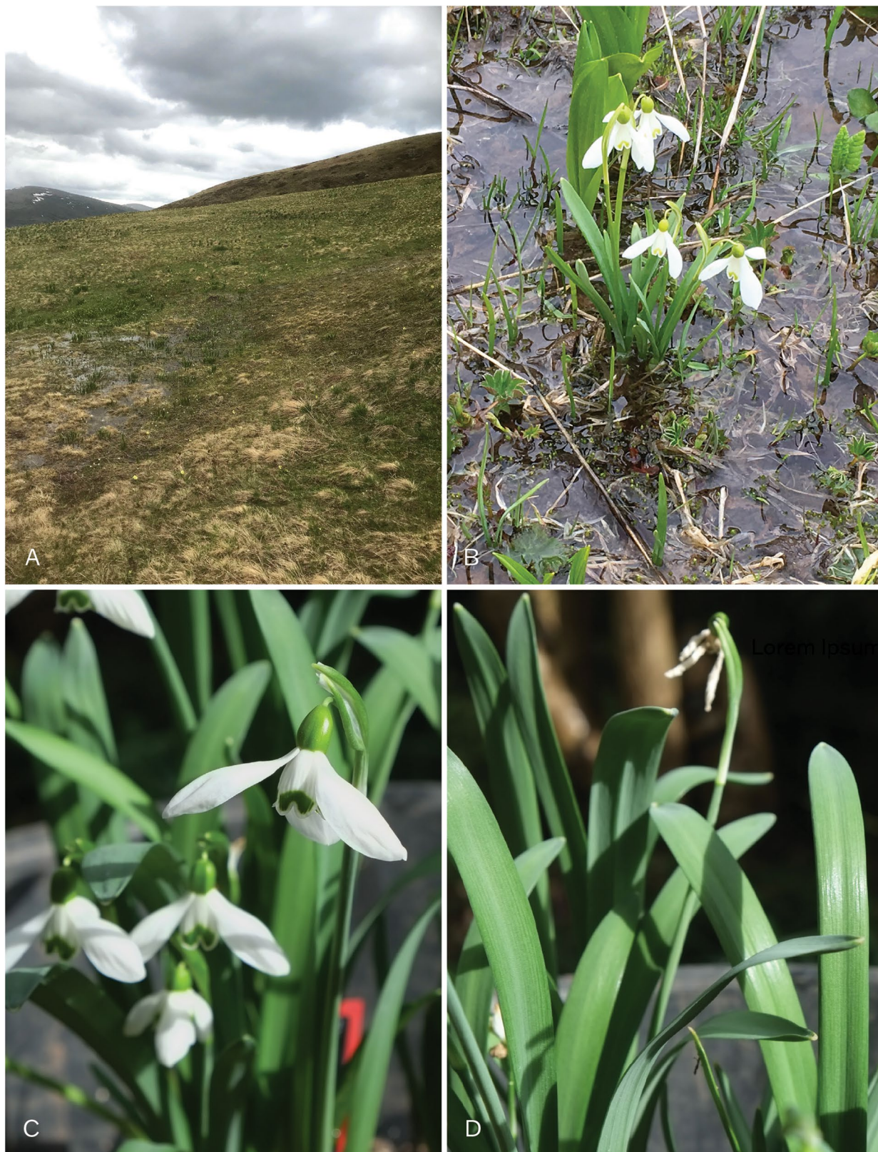
Fig. 2. Galanthus subalpinus in situ and in cultivation. A habitat, subalpine grassland; B small clump, situated in an ephemeral water pool; C flowers; D leaves at early fruiting stage. A – B North Macedonia; C – D UK, in cultivation.